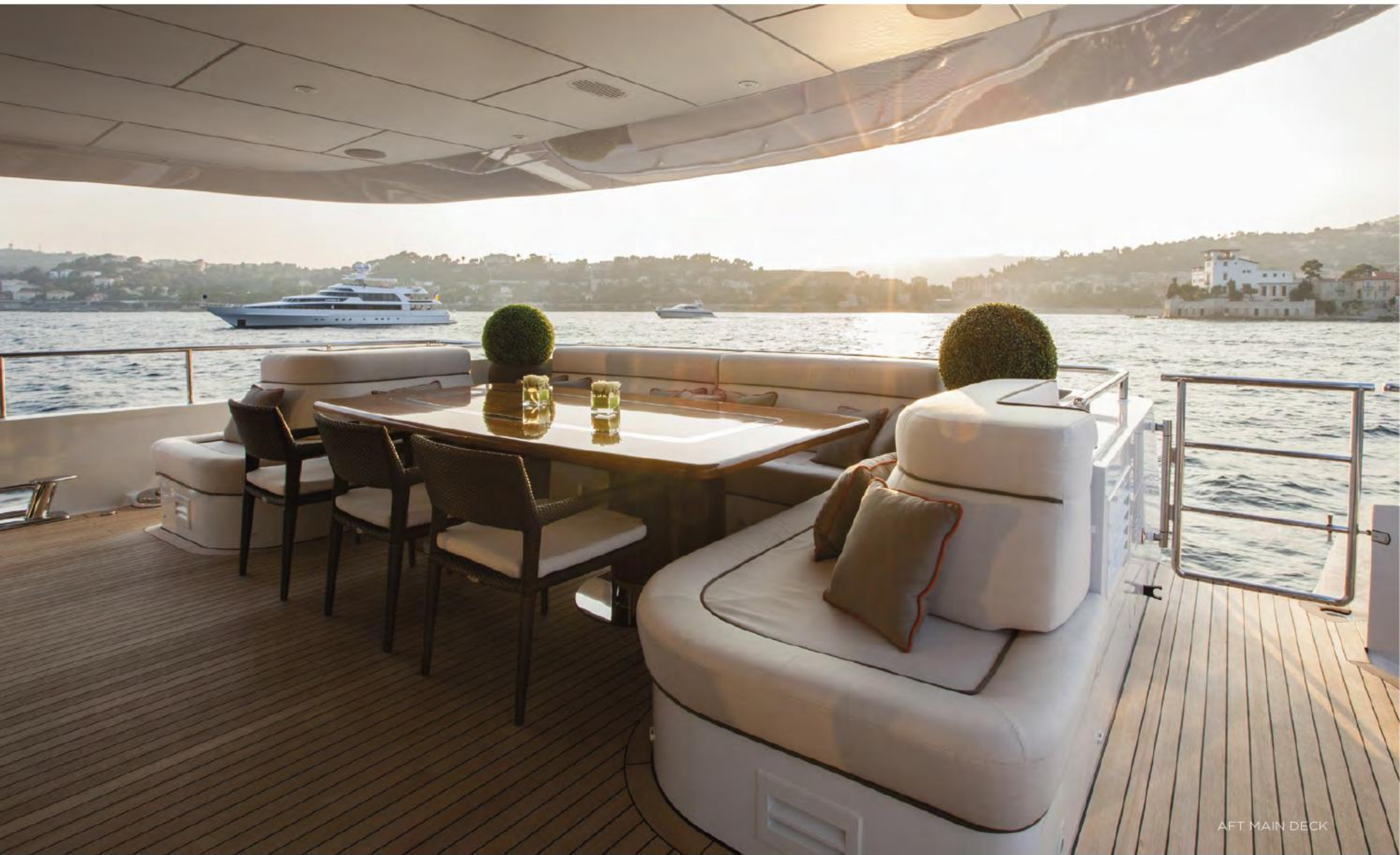
AFT MAIN DECK