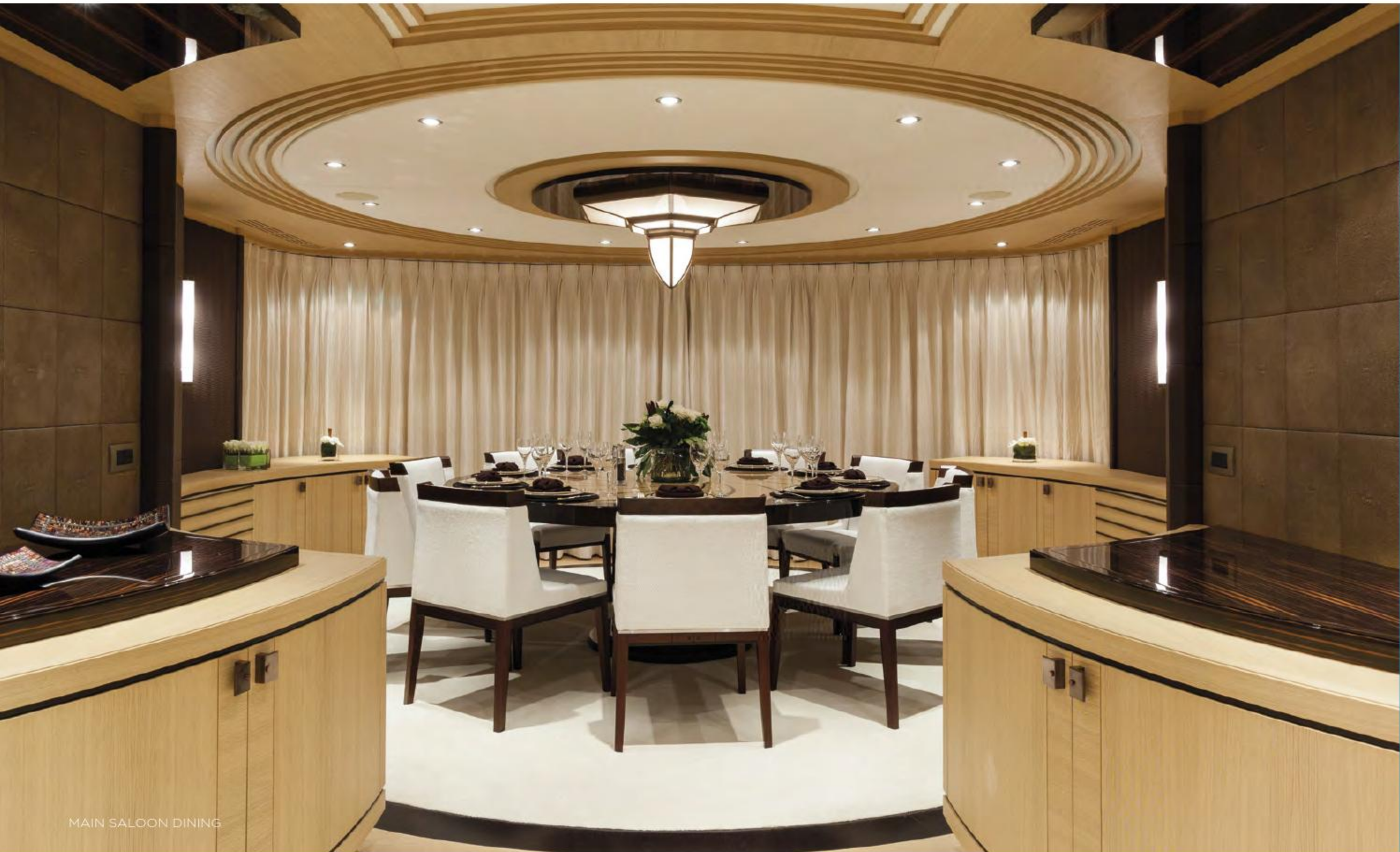
MAIN SALOON DINING